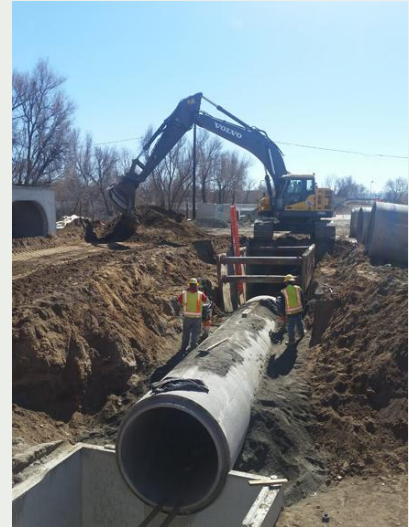
Project team installing drainage pipe in the Bottoms.

Work in the Bottoms area is anticipated for completion this fall.