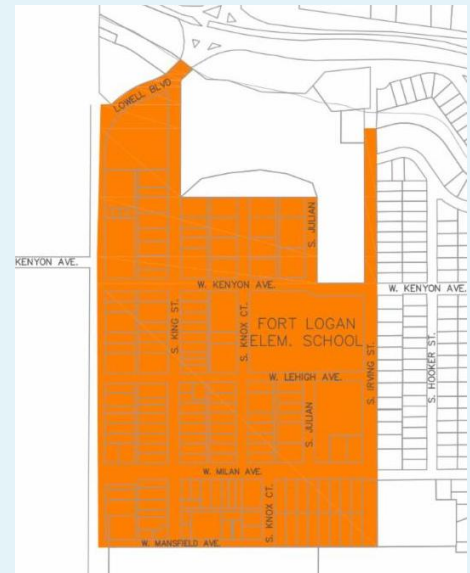
Map of Fort Logan/Northgate construction area. Click here to enlarge.

School Parking Lot 4000 S Lowell Blvd, Denver, CO 80236 Sheridan, CO 80110