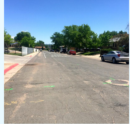
Before photo of W. Mountain Road

This work will also be conducted during the summer when school is not in session.